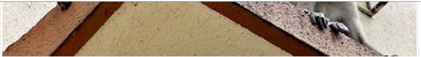
Sections of the Sanjay Gandhi National Park (SGNP) will also get a ecologically sensitive zone